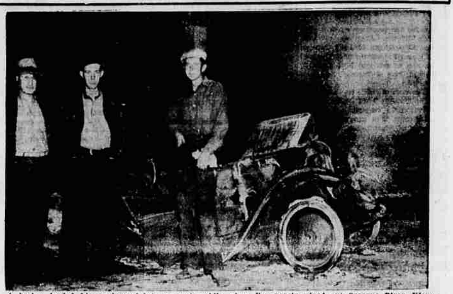
A barber loaded his equipment into an automobile when fire nearly wiped out Sprague River, Klamath county, and caused a $50,000 loss. The engine refused to start and the car burned—his escape, by a close shave, fizzled. The barber was uninjured.