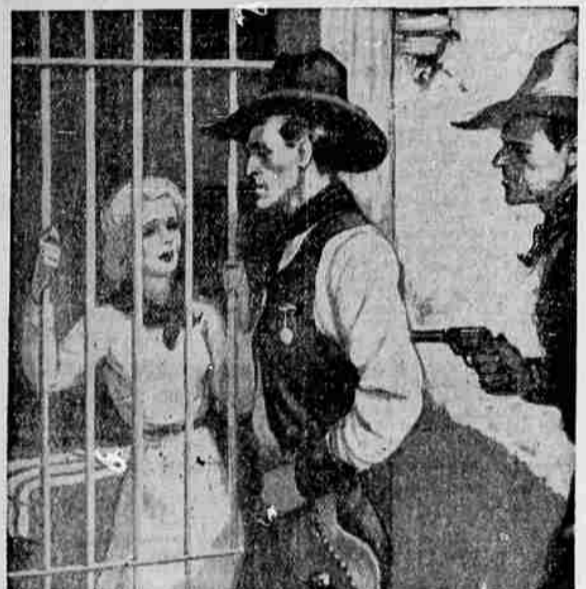
"I'm arrestin' you for the murder of Kelton Dreen."

HE DID, and it made him feel lower in his own estimation than the lowest snake. Yet he had done nothing to place himself in this position. If she had built her hopes on a false premise, could that be charged to him? He had not said he loved her; he'd done nothing to imply it. It was, he told himself, the fact of his being here that had brought her hopes to their present peak; she must feel he would not have come unless he cared!