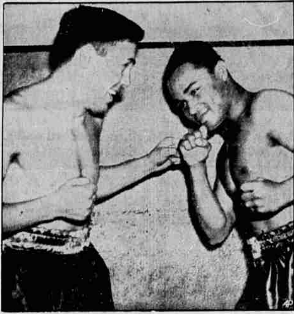
It was just for fun when Lou Ambers (left), lightweight champion, and Henry Armstrong struck a sparring pose after they weighed in for their fight Wednesday. Ambers weighed 135 and Armstrong 133½. The fight was later postponed to next Wednesday, because of rain.