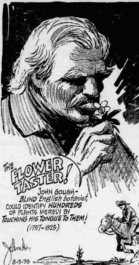
THE FLOWER TASTER! JOHN GOUGH—BLIND ENGLISH BOTANIST, COULD IDENTIFY HUNDREDS OF PLANTS MERELY BY TOUCHING HIS TONGUE TO THEM! (1757-1825)

For further proof address the author, inclosing a stamped envelope for reply. Reg. U. S. Pat. Off.