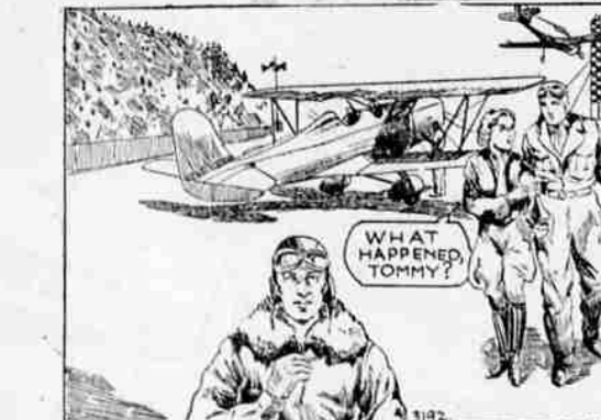
BEN WEBSTER'S CAREER