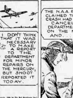
BEN WEBSTER'S CAREER