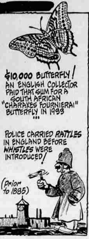
$10,000 BUTTERFLY! AN ENGLISH COLLECTOR PAID THAT SUM FOR A SOUTH AFRICAN "CHARAXES FOURNIERAI" BUTTERFLY IN 1938