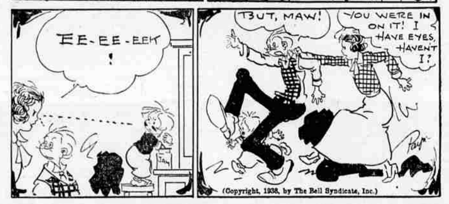
By HAL FORRE