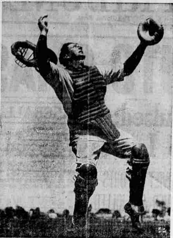
HE CATCHES and he hits—does Ernie Lombardi, Cincinnati Reds' catcher who hit top in National League batting