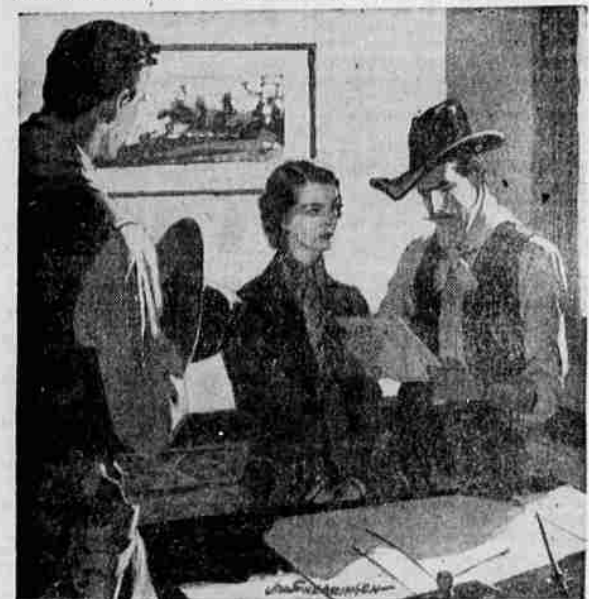
To Ankrom the prospect seemed anything but fine.

Ankrom could feel the eyes of his companions upon him. His face was inscrutable as he rose from his place, pulled the last lungful of smoke from his cigarette and ground the butt into a dish. Still without speaking he passed through the open door and out into the gloom of early night.