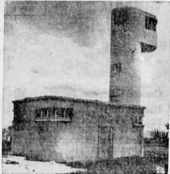
PEAK MIGRATION of Jews into Palestine was in 1925 when more than 61,000 went into the land, put up watchtowers like this as precaution against marauders. Since 1934 total is about 150,000. Even while latest bombings were in the news, statesmen at Evian-les-Bains, France, were considering the problem of Jewish refugees, particularly those anxious to quit Germany.