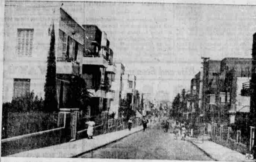
IN PALESTINE, THE HOLY LAND —"Holy" to Moslems, Jews and Christians who for centuries have lived there, each group retaining its own customs—is Tel Aviv, a street of which is shown above. Tel Aviv, all-Jewish city, has been established about 25 years, has a population close to 125,000, and is near Jaffa. Tel Aviv figures inevitably in stories of Jewish-Arab disturbances which spring from the plan for a Jewish national home in Palestine to shelter Jewish refugees, and from the Arabs' deep-rooted conviction that Palestine is their own land.