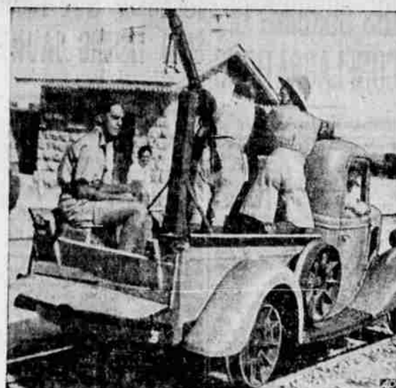
SOLDIERS AND SHIPS have been rushed to Palestine by England whose scheme to divide Palestine into three states—Arabian, British, and Jewish—is opposed by Arabs and Jews. Above a British railcar patrols railway line between all-Jewish Tel Aviv and Haifa, scene of bloodiest of recent outbreaks. Jerusalem, sacred to Christianity, has also seen rioting.