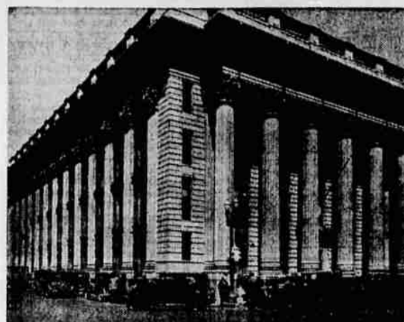
This imposing structure at the corner of Broadway and Sixth at Stark streets in Portland, Oregon, is the home of the United States National Bank. This bank is the home office for 32 branch banks throughout the state.