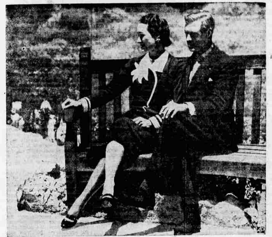
WITH A NEW COIFFURE, the Duchess of Windsor started second year as wife of Edward, with whom she poses near Anibes, France. The waves are softer, nearer the park.