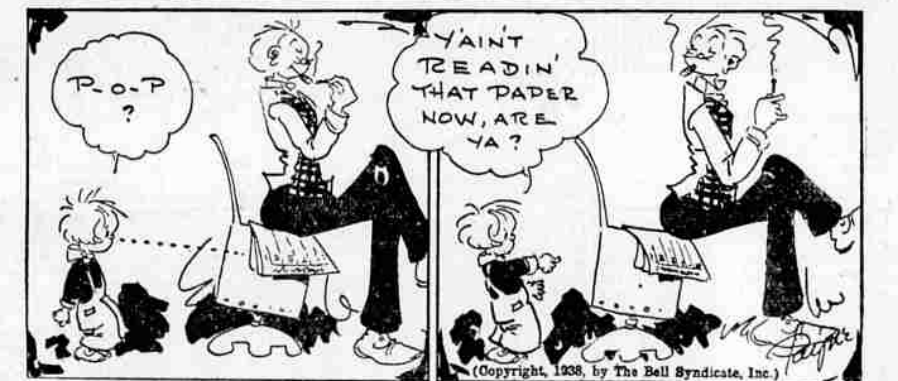
(Copyright, 1938, by The Bell Syndicate, Inc.)