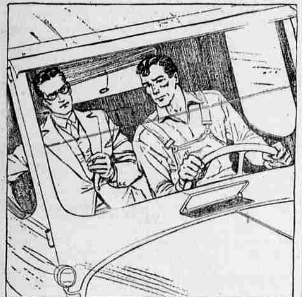
Tim blinked as the speedometer swung around the dial.