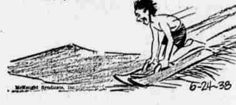
HAWAIIAN CHILDREN BOBBLIN' IN THE SUMMER—ON GRASS-COVERED "PUNCHBOWL HILL," HONOLULU...