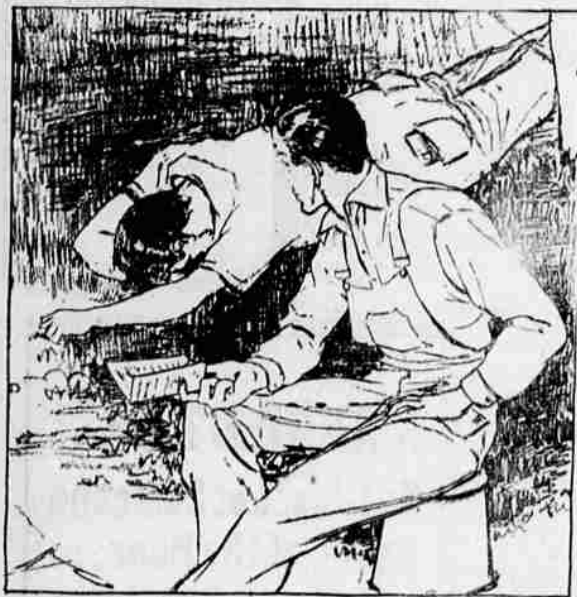
It was enough to make a far stronger man weep.

Asy took off his cap and mopped his forehead. "Hot," he agreed, "on all sides."