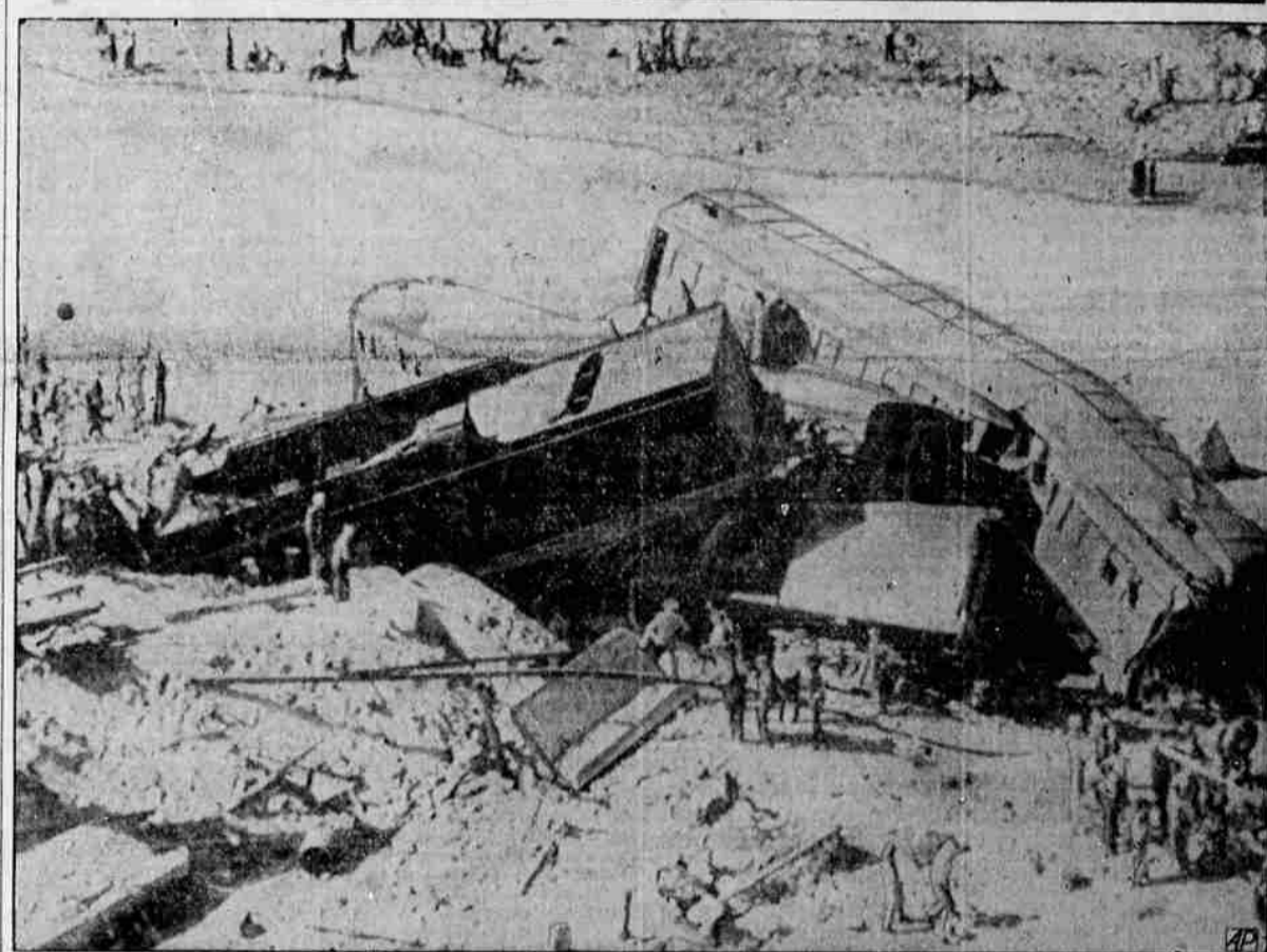
At top is an air view of the scene near Miles City, Mont., where the Milwaukee railroad's "Olympian" passenger train crashed early Sunday through a flood-weakened trestle into a swollen mountain creek. Nearly forty passengers met death and scores were injured. One car is shown almost completely submerged with other cars piled up on the right bank. Still other cars, which did not leave the track, can be seen on the left. In center close-up one coach is shown broken in the center. Most of the dead were trapped in another car which was almost entirely submerged. The arrow on map below points to location of the tragedy, worst in American railroading history.