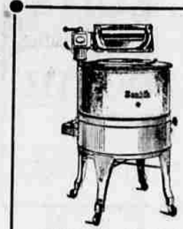
THIRD PRIZE Zenith Washer