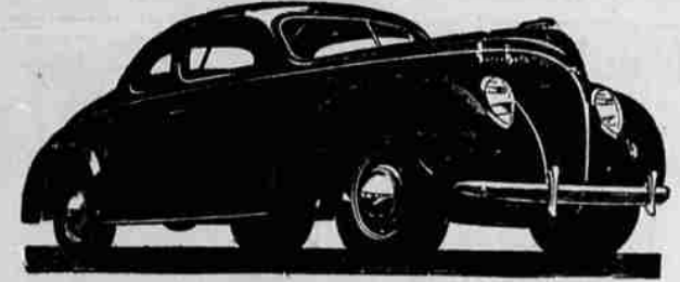
FIRST PRIZE FORD V-8 (85) COUPE With U S Royal Master Tires

LOOK AT THESE AMAZING PRIZES! ANYBODY CAN WIN!