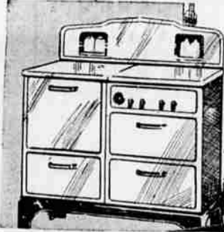
SPECIAL PRIZE! ETON Universal GAS RANGE

ALL PRIZES ON DISPLAY at Contest Headquarters MAIN AND BARTLETT STS. Medford