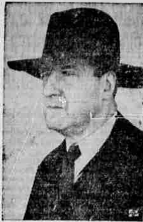
INDIGNANT Rabbi Stephen Wise, returning from abroad, warns against onward march of Fascism, reproached England for "dilatoriness" in recent Austrian seizure.