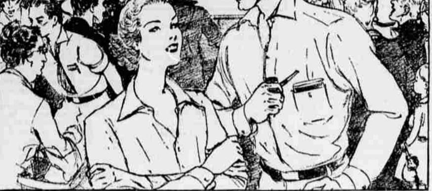
"Wheel!" Asey said. "Wheel!" The girl standing beside him chuckled. "Say it, Asey," she advised pleasantly. "Don't try to hold in."