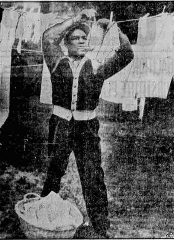
When Henry Armstrong (above) enters the ring in Madison Square Garden bowl May 26 in quest of the welterweight title, he'll try to put Barney Ross on the ropes, just as he's doing with these clothes at his training camp in Pompton Lakes, N. J.