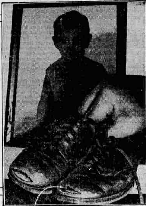
Travelers Safety Service

O little shoes with the scuffed-up toes, That look so small in his father's hand, Weren't you proud and big and grand When you started this morning for No-One-Knows?