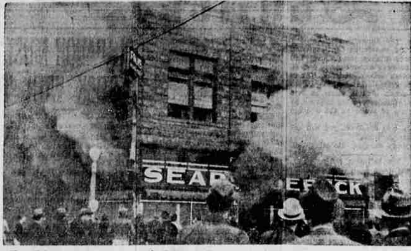
Fire originating from an undetermined cause in the basement of the Falk store in Baker, on Tuesday, caused damage of $35,000 before it was controlled. The flames were confined to the basement and smoke and water caused the principal damage to the stock, 60 percent of which was ruined. One fireman was injured by falling glass.