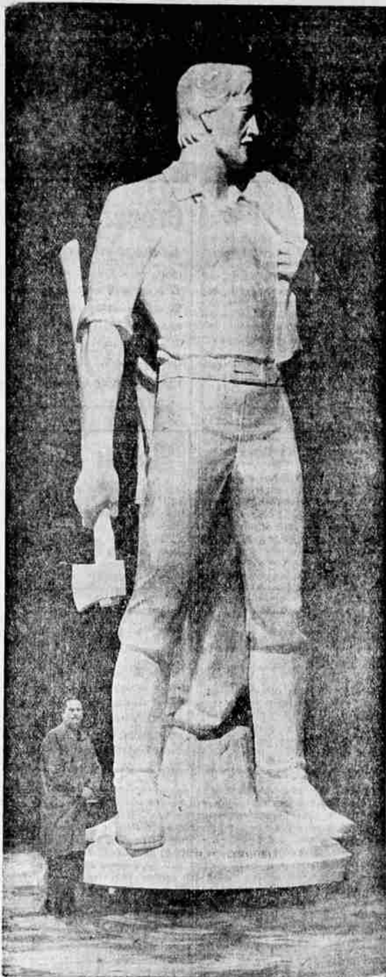
This wax model of a six-ton, 34-foot bronze statue will be cast at the New York studio of Urie H. Ellerhusen and the finished creation placed on the dome of the new Oregon capitol building at Salem. The figure, a symbol of the Oregon pioneer, will survey the country from a height of 121 feet.