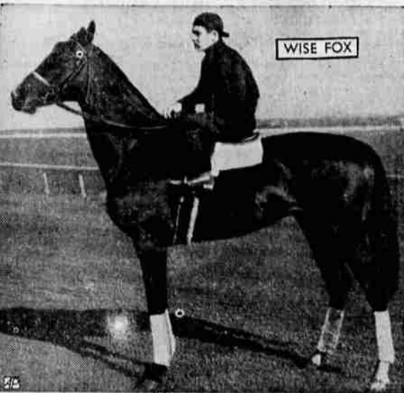
Wise Fox, winner of the Louisiana derby in March, is a candidate for the 1938 Kentucky derby to be run at Churchill Downs May 7. Wise Fox is a son of Gallant Fox out of Minerva.