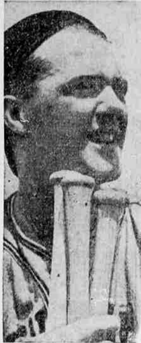
NO. 1 ROOKIE may be Cleveland Indians' Ken Keltner who hit .337 last year.