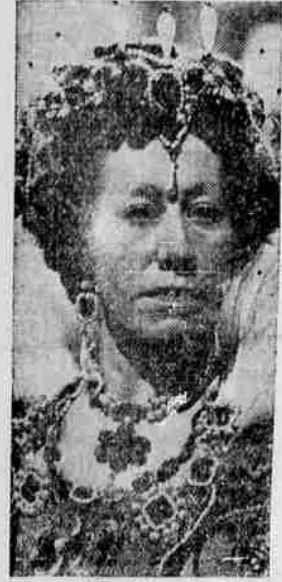
Flora Robson in "Fire Over England."

A special matinee of "Fire Over England" will be given at the Varsity theater in Ashland Wednesday afternoon for students of the Phoenix, Talent and Ashland schools. The show will be presented at 2 p. m. and the schools will be dismissed for the matinee. The film will be repeated Wednesday evening at the Varsity. Several short subjects will also be shown to round out a complete program of motion picture entertainment. The matinee and evening show is a benefit for the Oregon Shakespeare fund, the presentation being in charge of Prof. Angus L. Bowmer.