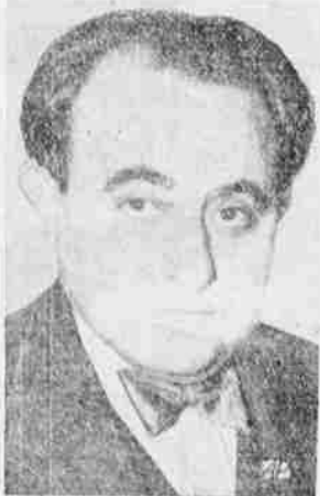
TO MEXICO returns Gordon Ordas, Loyalist Spain envoy, after visit to war scene.