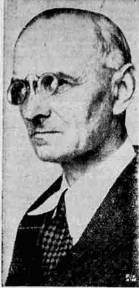
SECRETS don't escape tight-lipped Gen. Baron Alexander von Falkenhausen (above), German advisor to Chiang Kai-Shek, Chinese war leader.

Weather Forecast Oregon: Unsettled tonight and Tuesday; showers over mountains; cooler in south and east portions; moderate to fresh northwest wind off coast.