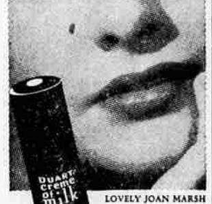
LOVELY JOAN MARSH