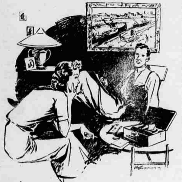
David was having fun budgeting. Said he was feeling married for the first time.

Chapter 31 A Little Tight Budgeting NINA was thinking the same old thoughts, all over again. Her terrible, insatiable longing to have Richard for her own... No effort, no reasoning, had been able to curb it. Now perhaps separation might.