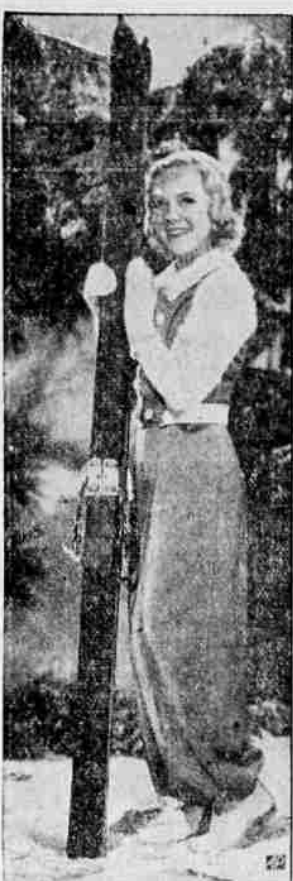
SHE ALSO SKATES, but Sonja Henie, ice and movie artist, shows what the well-dressed woman skier will wear.