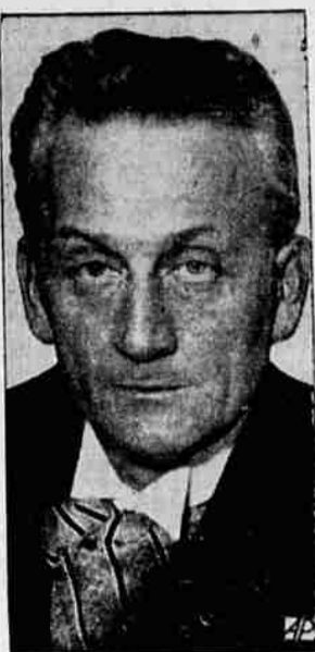
SERVING SCIENCE through research in the field of vitamins won a Nobel prize for Prof. Adalbert Szentgyorgyi, of Szeged University, Hungary.

Robbers sometime Wednesday night or early Thursday morning broke into the Medford pharmacy in the Fluhrer building and stole $20 in cash hidden in the prescription room.