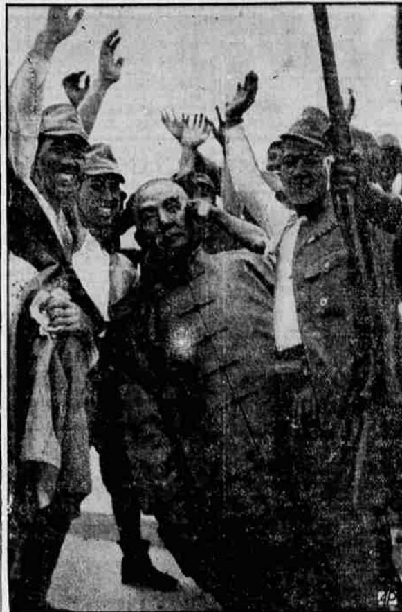
SUN DOWN IN SHANGHAI was given another meaning by Japanese gunmen who blew this metal statue of Sun-Yat-Sen of China, "father of the revolution," from its base. When infantry occupied the spot the fallen figure of the Chinese leader became a symbol of victory for Japanese troops.