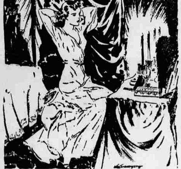
Nina brushed her hair in a sort of daze.

sort of gift—as indeed she had—and had understood her much better.