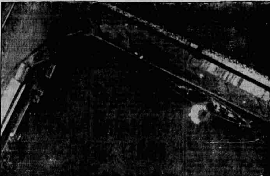
A WARSHIP SPEAKS AND PLANES REPLY with deadly result. The top picture shows the Spanish battleship Jaime Primo opening up with anti-aircraft guns as insurgent planes were sighted over her wharf at Almeria, Spain. Below can be seen the effect of accurate insurgent aerial aim as 2,500 pounds of bombs score direct hits, tearing away the ship's superstructure and all but sinking her. This photo is one of the first group to be released from insurgent aviation files.

MANY REGISTERED AT JACKSONVILLE MUSEUM Jacksonville, Oct. 18.—During August 471 visitors registered at the museum here but at the end of the month it was closed because there were no funds available for maintenance.