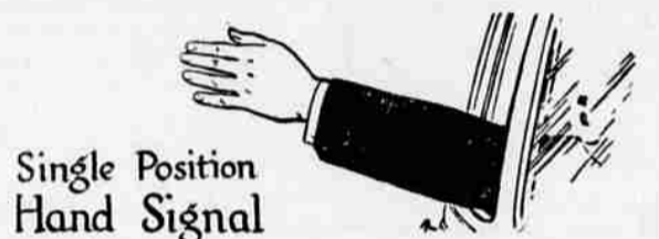
Single Position Hand Signal