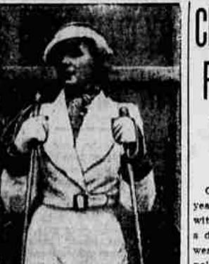
CHICAGO GIRL, 12, FOUND SHACKLED TO KEEP AT HOME