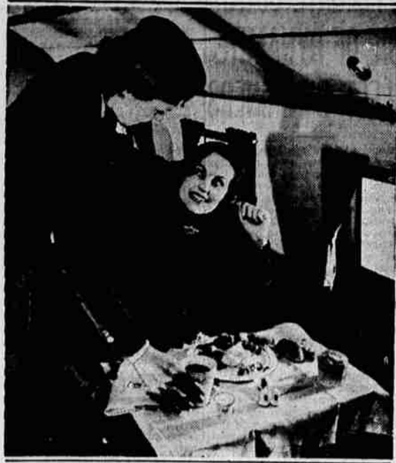
Hot a la carte meals served aloft by stewardesses to passengers on United Air Lines' Skyglound type Mainliners are a feature of the modern development of transportation, which provides de luxe schedules crossing the continent in 15 hours and 20 minutes.