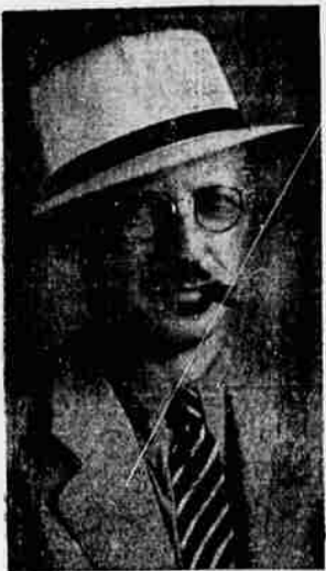
To The People Of Southern Oregon and Northern California

NEW LOCATION • NINTH AND BARTLETT STREETS • MEDFORD • TELEPHONE 303