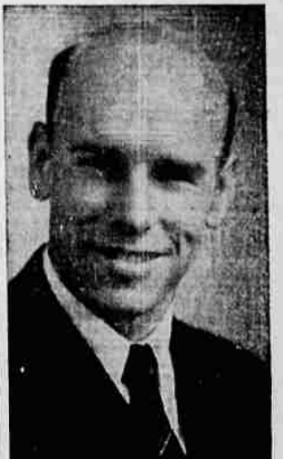
tion to the distribution of White and Indiana trucks, Allis-Chalmers tractors and farm machinery and Hardie sprayers.