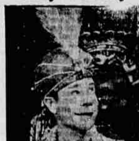
Joe E. Brown's latest character for the screen is that of astrologer extraordinary in the feature comedy production "When's Your Birthday?" playing at the Roxy theatre today and tomorrow. Marian Marsh, Fred Keating and Edgar Kennedy have important roles in the laugh-film.