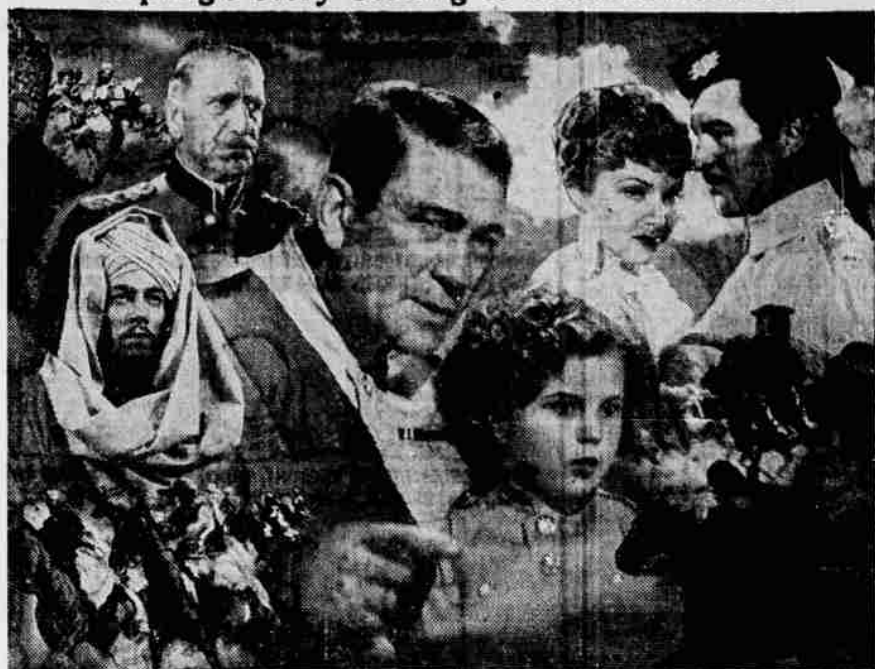
One of the most ambitious motion picture productions of the year, an outstanding contribution to the new show season, comes to the New Craterian theatre for a four-day showing with the opening Wednesday of Rudyard Kipling's heroic story of adventure in the land of the Bengal Lancers.

erian theatre for a four-day showing with the opening Wednesday of Rudyard Kipling's heroic story of adventure in the land of the Bengal Lancers.