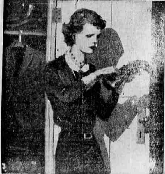
With a gasp, Kay saw a nail head missing.