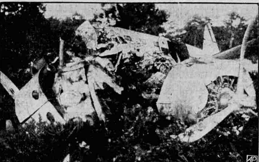
Here is the wreckage of the big Eastern Air Lines plane which crashed near Daytona Beach, Fla., with loss of four lives, after striking a power line near the airport there. The crash, the first fatal one for the line, brought injuries to five other persons. Below is Capt. Stewart Dietz of Baltimore, chief pilot, who was killed.