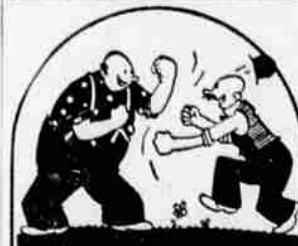
The Morning After Taking Carler's Little Liver Pills

Closing time for Too Late to Classify Ads is 1:30 p. m.