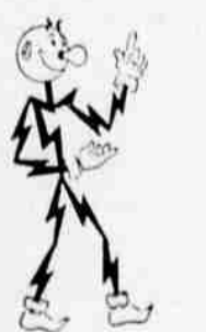
REDDY KILOWATT Your Electrical Servant

Instant Hot Water Saves Many Precious Minutes