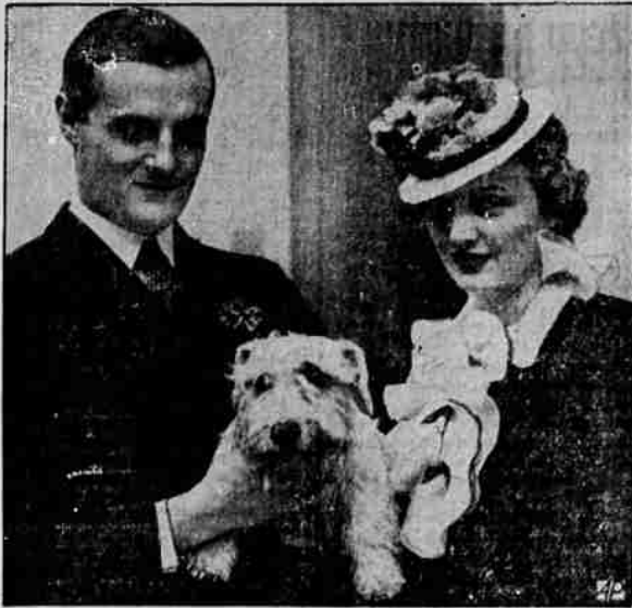
Virginia Cherrill, who became famous as the blind flower girl in the Chaplin picture, "City Lights," soon will become the bride of the Earl of Jersey, with whom she is shown. The pup is Miss Cherrill's Sealham, "Junior."