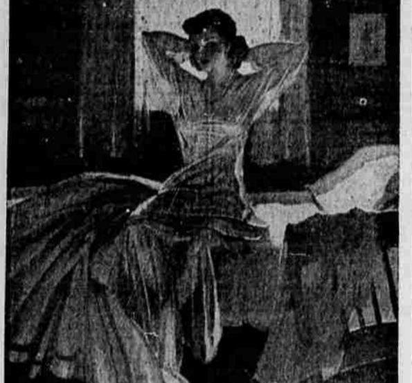
Somehow Kay knew he was coming back to her.

had brought of Ted's first fight with Scrap Johnson. Whatever reasons he had had for not telling her, she was going to give him the benefit of the doubt, and wait until he was ready to tell her.