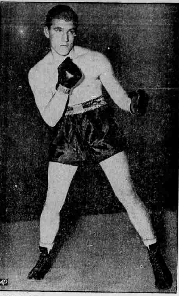
HELLO JOE. With these menacing mitts as his passport and ticket, Tommy Farr, England's heavyweight champion and pride, came west to seek his fortune against Champ Joe Louis. He impressed New Yorkers with his confidence and hard-boiled appearance.

Pioneer Dies WALLA WALLA, July 28.—(AP)—An early day resident of both Walla