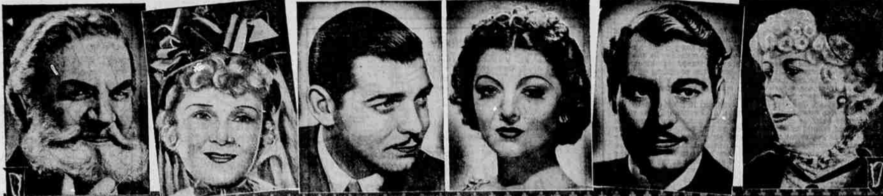
Here are the brilliant stars of "Parnell," the tremendously moving fictional drama of Charles Stewart Parnell, "uncrowned king of Ireland" which opens its local run Sunday at the New Craterian. Left to right: Berton Churchill as O'Gorman Mahon, Billie Burke as Clara, Clark Gable as Parnell, Myrna Loy as Katie O'Shea, Alan Marshall as Capt. Willie O'Shea and Edna May Oliver as Aunt Ben. The story of the dynamic Irish patriot who sacrificed a glorious career because of another man's wife is said to give Clark Gable his strongest characterization to date.