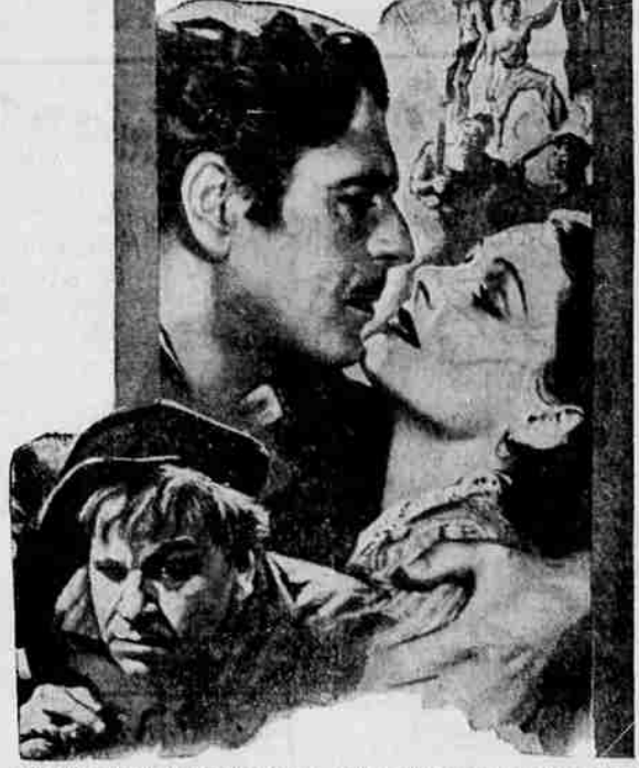
Two lovers held captive on a honey-moon ship drama with mutiny, spectacular drama that storms its epic sweep over the seven seas; the thundering saga of the last of the slaves, "Slave Ship" comes tomorrow to the New Criterion theatre, its huge cast headed by Warner Baxter, Wallace Beery, Elizabeth Allan and Mickey Rooney.

Chicago Wheat CHICAGO, July 21. —(AP)—Wheat: Open High Low Close July 1.10 1/2 1.22 1/2 1.20 1.20 Sep. 1.20-1.21 1.22 1/2 1.20 1.22 1/2 Dec. 1.22-23 1.24 1/2 1.21 1/2 1.24 1/2