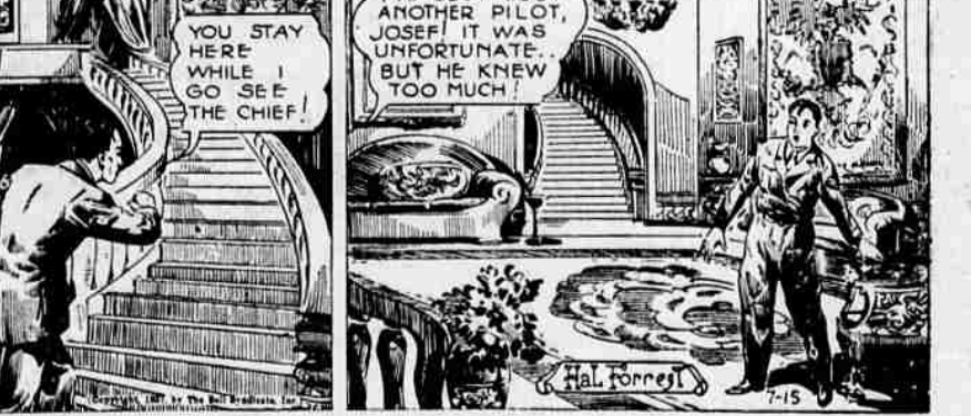
By EDWIN ALGER