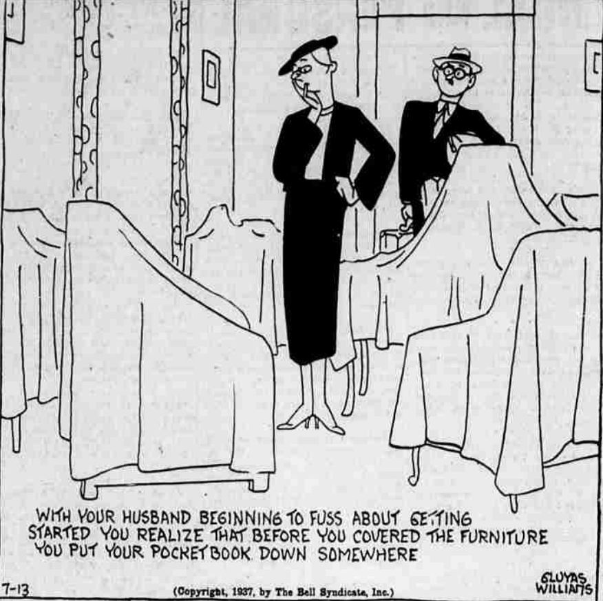
7-13 (Copyright, 1937, by The Bell Syndicate, Inc.)