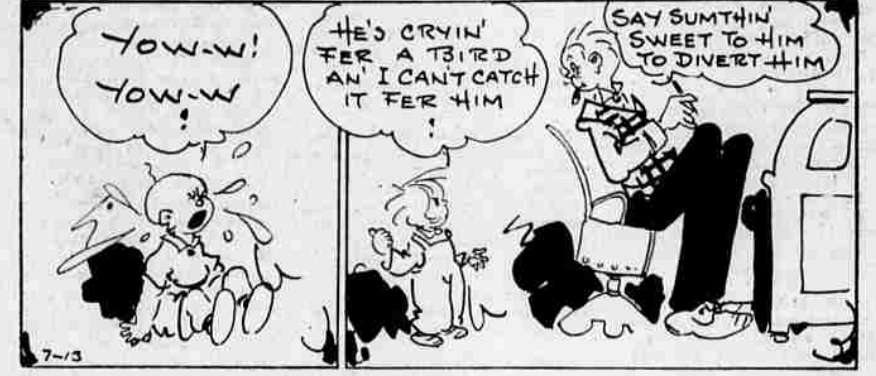
7-13 (Copyright, 1937, by The Bell Syndicate, Inc.)