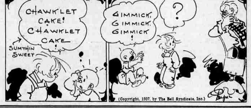
(Copyright, 1937, by The Bell Syndicate, Inc.)