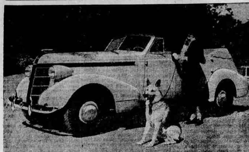
For the first time in Pontiac's history, a convertible sedan model has been added to this distinguished line of cars. With the top up, this Pontiac eight-cylinder convertible sedan is an all-weather model, and with the top snugly folded down it becomes the perfect car for spring, as this young lady will attest. Both six and eight cylinder convertible models are now on display at local dealers here.