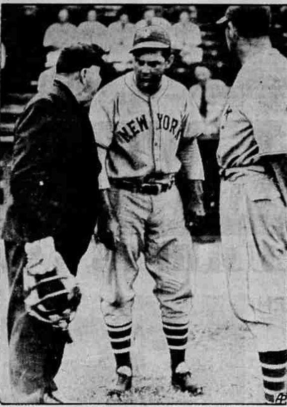
Hill Terry, manager of the New York Giants, started to argue with Umpire Klem in the ninth inning of a game in Philadelphia and was chased to the clubhouse for his effort. He's shown starting the losing argument.