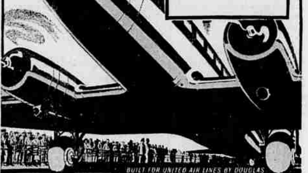
BUILT FOR UNITED AIR LINES BY DOUGLAS