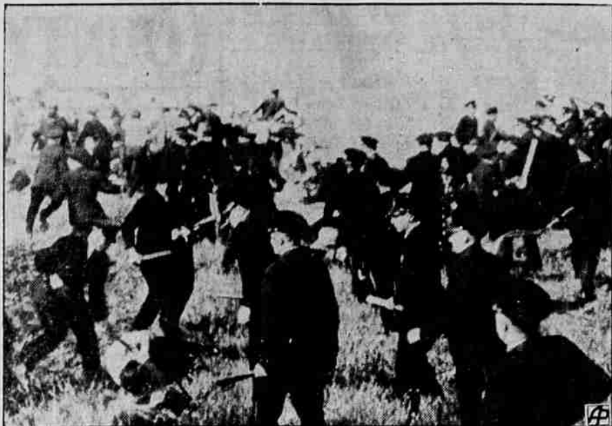
This action picture was part of the Paramount newsreel film which was shown as evidence before the senate civil liberties committee in connection with investigation of the South Chicago steel strike riot, May 30.