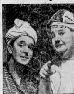
Laurel and Hardy co-starring in "Our Relations" plays at the Roxy theater for today and tomorrow with the popular two-reel colored Popeye cartoon "Popeye Meets Sinbad the Sailor" as an added attraction.