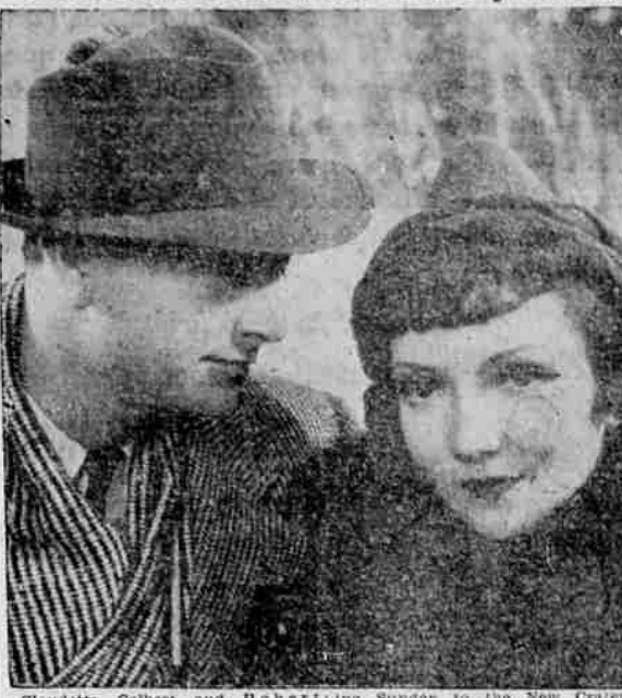
Claudette Colbert and Robert Douglas are featured with Melvyn Douglas in "I Met Him in Paris" at the sparkling comedy-romance coming Sunday to the New Craterian theater. The company spent several weeks filming the snow scenes at the new Sun Valley winter resort in Idaho.