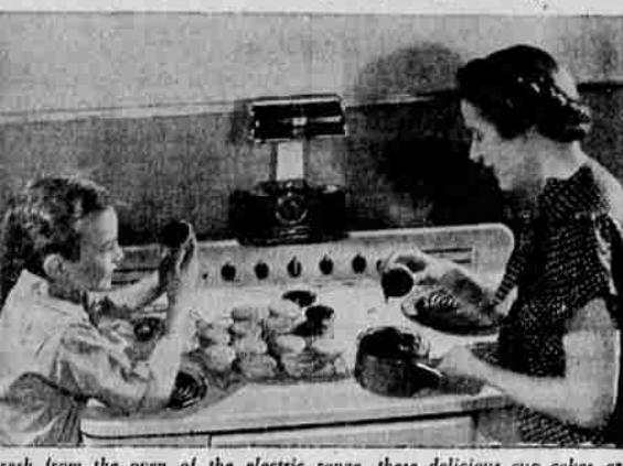
Fresh from the oven of the electric range, these delicious cup cakes are dipped in chocolate icing cooked on the surface unit of the range.

Sometimes the adventurous kitcheners here in the Institute develop a recipe that even gets our sophisticated culinary artists "set up." Only recently there was quite a flurry of excitement over a new chocolate icing made on the new high-speed Calrod units of the electric range that is the answer to a homemaker's prayer.