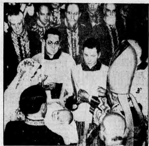
BLESS HIS HEART. It was a great occasion, broadcast by Italian radio stations, when the infant Prince Victor Emmanuel of Naples, heir once removed from the throne, was christened in Rome. Here is a scene from the colorful ceremony.

To offset the upward price trend, which was initiated at the beginning of the Ethiopian war, the government has ordered a general wage increase